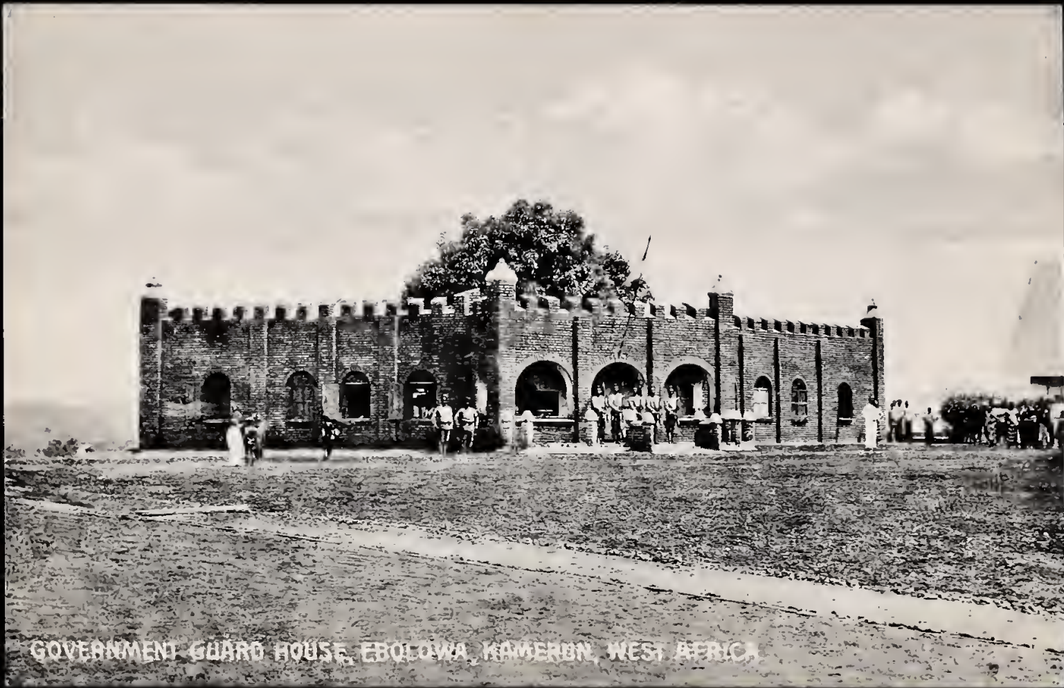
GOVERNMENT GUARD HOUSE, EBOLOWA, KAMERUN, WEST AFRICA